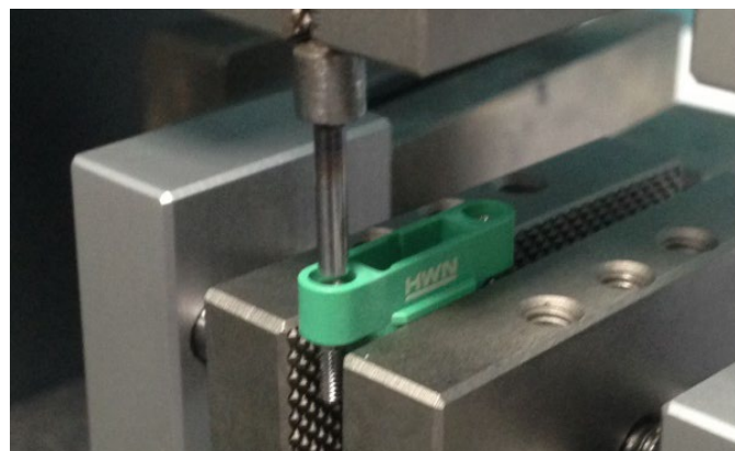
Figure 2: Testing set up with push out pin locating into the male connector